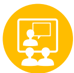
Featured Topic Webinars

A variety of educational and counseling opportunities are available, including webinars on retirement-related topics. Register online today at www.psr-peers.org .