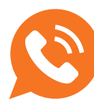
Phone Counseling Sessions