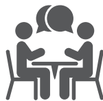
One-on-One Counseling Sessions