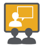
Web Counseling Sessions