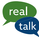
RealTalk Webinar Sessions